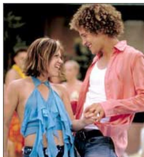
20th Century Fox

In this plug-and-play entertainment economy, concepts and marketing have become so dominant that performers are increasingly finding themselves treated like one more bit of product placement. Abundant, disposable celebrities and a proliferation of entertainment options on cable, the World Wide Web and game systems have created a cluttered environment where easy-to-understand conceits — like "The Bachelor" and "X-Men" — are needed