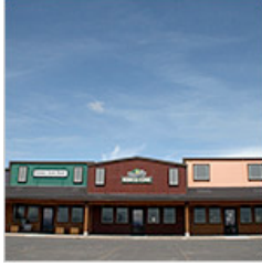
A Brief Political Movement Fades Away