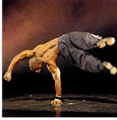
Cultural Walkabout (on Feet and Hands)