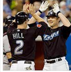
Blue Jays Hold First Place, and Their Breath