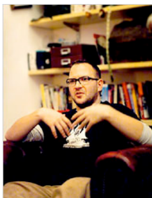
Cory Doctorow offers some free electronic versions of his books.