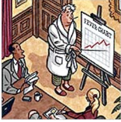
Do Everybody a Favor: Take a Sick Day