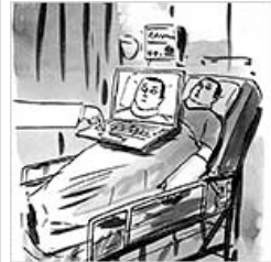
Letters: Doctor-Patient-Computer Relationships

Home | World | U.S. | N.Y. / Region | Business | Technology | Science | Health | Sports | Opinion | Arts | Style | Travel | Jobs | Real Estate | Automobiles | Back to Top