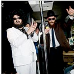
A Celebration on Wheels in Observance of Purim