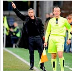
A Coach Cloaked in Armani and Confidence