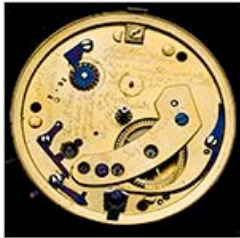
Timeless Lincoln Memento Is Revealed