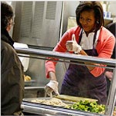
Michelle Obama's Healthful Agenda