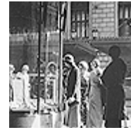
Photo: Window shopping at I. Miller, circa 1930 Price: $195. Learn More.