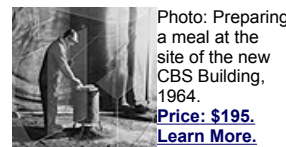
Photo: Preparing a meal at the site of the new CBS Building, 1964.